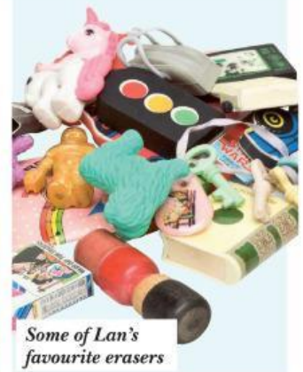
Some of Lan's favourite erasers