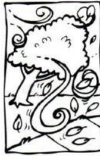
yesterday, the 3 rd