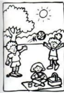
the 1 st