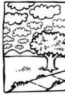
today, the 4 th