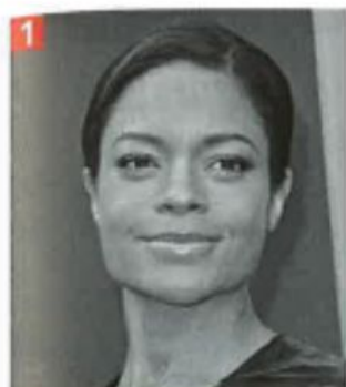
Naomie Harris, actress

7 Read about the people. Complete the paragraphs with his, her, our and their .