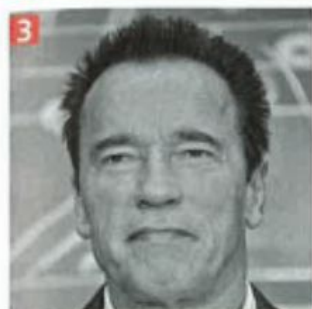
Arnold Schwarzenegger, actor and politician

I'm Sarah and this is my brother Mike. We're Australian. _____ parents are from New Zealand. _____ mother is from Queenstown and _____ father is from Wellington.