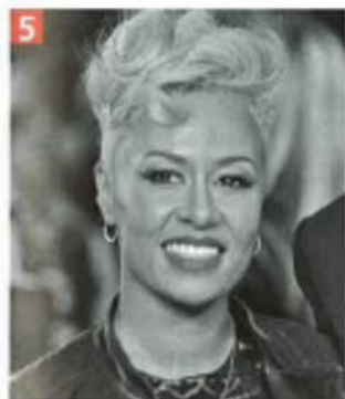
Emili Sandé, singer

Venus and Serena Williams are American. _____ parents are from the United States. _____ mother is from Michigan and _____ father is from Louisiana.