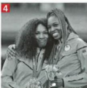
Venus and Serena Williams, tennis players

Venus and Serena Williams are American. _____ parents are from the United States. _____ mother is from Michigan and _____ father is from Louisiana.