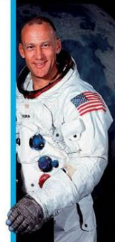
'Buzz' Aldrin: walked on the moon in 1969.