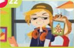
4.3 Grammar animation