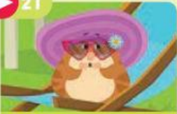
4.2 Grammar animation