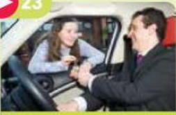
4.4 Communication video