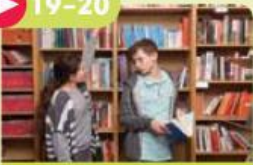
4.2 Grammar video