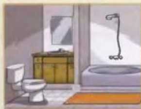
the floor of the bathroom