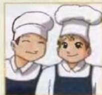
the cooks' hats