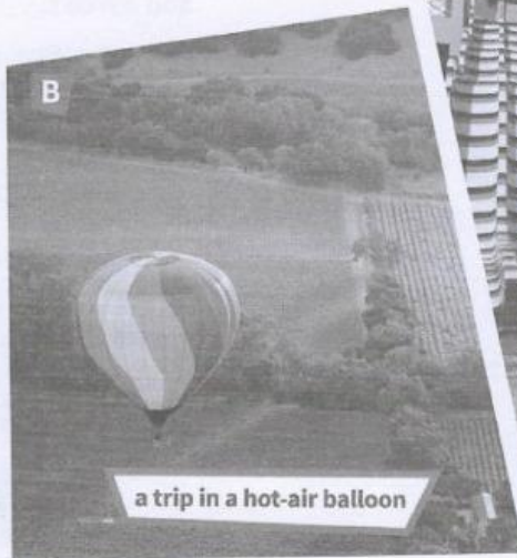
a trip in a hot-air balloon