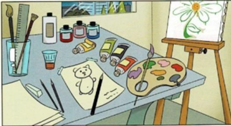
The New Art Class