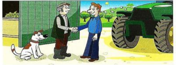
Dad at the farm