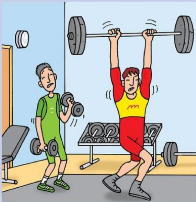
Pete is stronger than Tim.

We use the comparative adjective with than to compare two people or things.