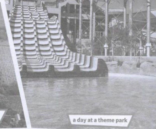
a day at a theme park