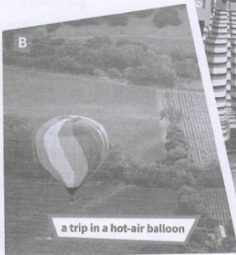
a trip in a hot-air balloon