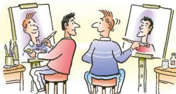
They are painting each other.