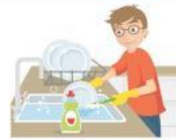
1 wash the dishes

do the shopping empty the bin look after your brother/sister make your bed tidy your room walk the dog wash the car wash the dishes