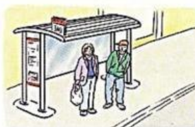
a bus stop