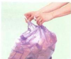
d _____ out the rubbish