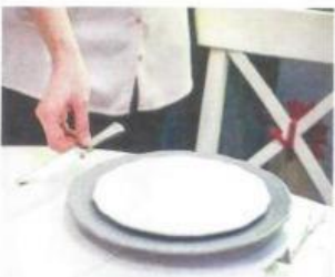
e _____ the table