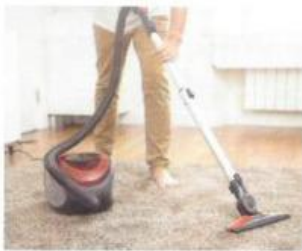
a vacuum the floor