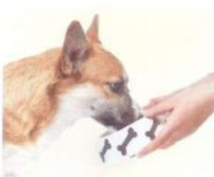
c _____ the dog