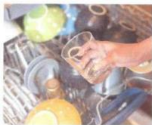
b _____ the dishwasher