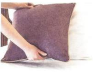
f _____ my bed