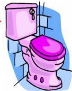
Domestic water use in Canada.

Home water use makes up a bout 5% of total water use worldwide.