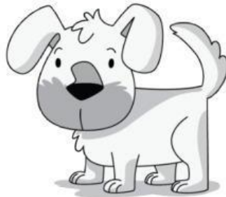
Dingo the Dog