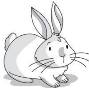
Rob the Rabbit