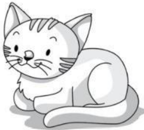
Kitty the Cat