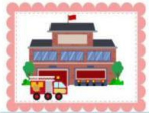
4. police station