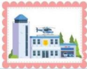
1. fire station