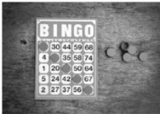
0. Bingo A