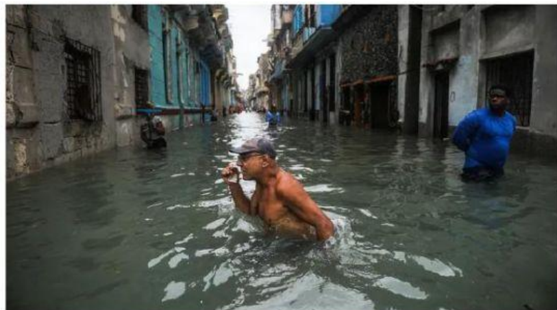
A Cuban wades through a flooded street in Havana, on September 10, 2017.