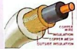
an electric cable