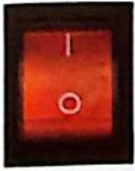
an electrical switch

ACTIVITY ONE: Look at the example and name the objects below.