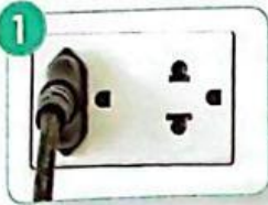
an electrical outlet