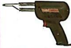
a soldering gun