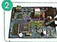
a circuit board