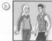
mom and dad