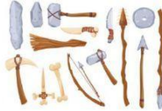
Stone, bone and wood.