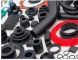
Plastic and rubber

1. The tools and weapons that first Americans used were made of: