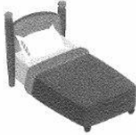
table sofa clock computer bed bookshelf