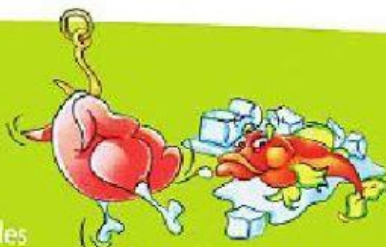
7 meat & fish