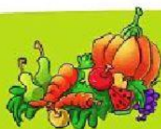
6 fruit & vegetables