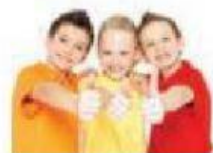
1 hang out with my friends

Look at the pictures. Write the activity.