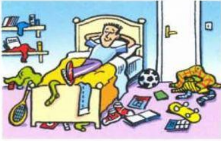
1 Peter / tidy / his room Peter didn't tidy his room.