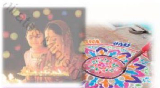
a. Eid Al Fitr (Saudi, UAE, Egypt)

Match the picture with the festival and country.