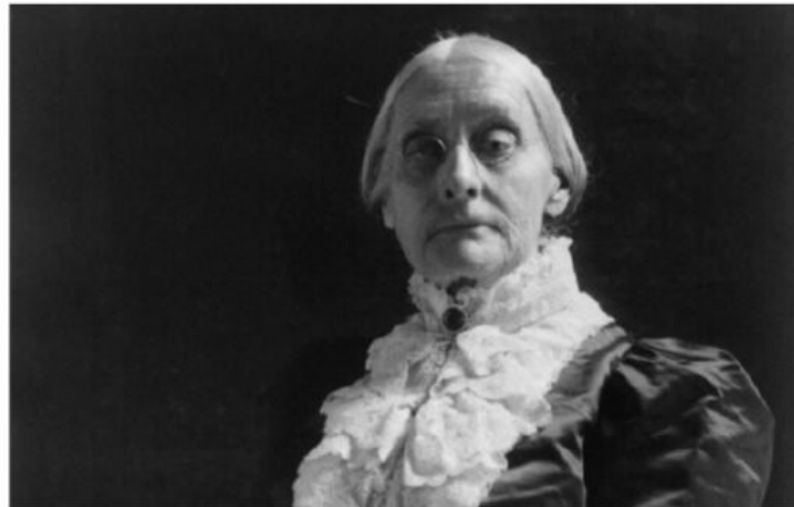
Susan B. Anthony

“_____ inspired change in her community by becoming an activist for women’s right to vote.”