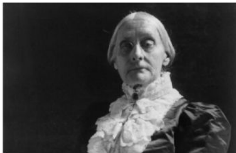
Susan B. Anthony

“_____ inspired change in her community by fighting for women’s right to vote.”