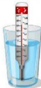
put a thermometer into the liquid