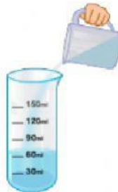
put the liquid in a measuring glass

4 To measure the volume of a liquid we _____ and then observe the reading.