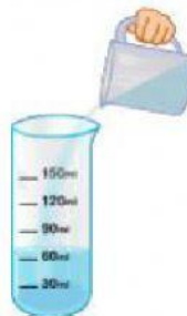
put the liquid in a measuring glass

7 To measure the temperature of a liquid we _____ and then observe the reading.