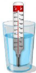
put a thermometer in the liquid

5 . A measuring glass is used to compare the _____ of two substances.