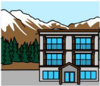
At the ski resort