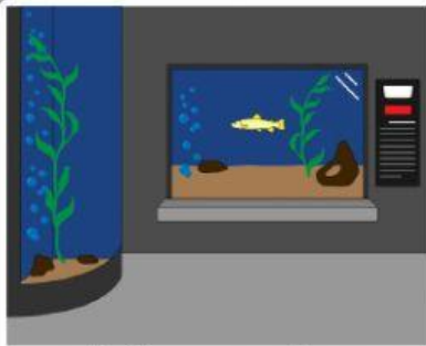
At the aquarium