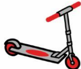
They took turns riding a scooter.