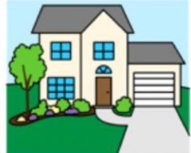
At her house