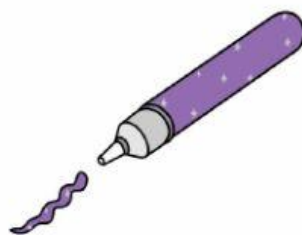
They used glitter glue to make crafts.