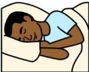
They found a way to all sleep at night.