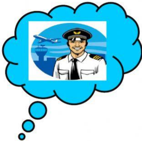
He is a pilot.