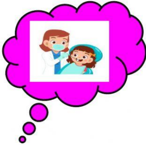
She is a dentist.