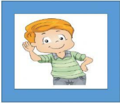
He is brother.