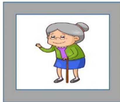
She is granny.