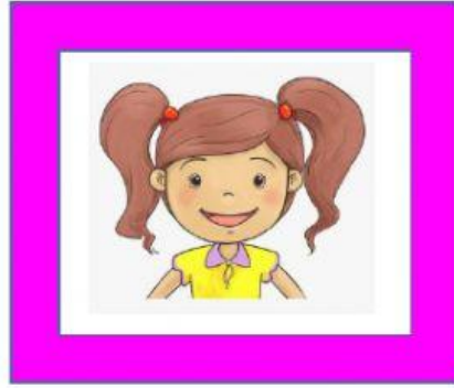
She is sister.