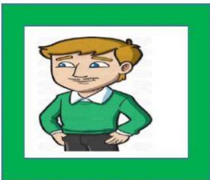
He is dad.