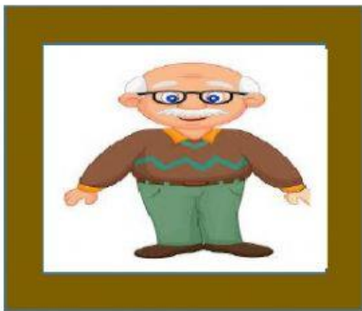
He is grandad.