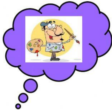
He is an artist.