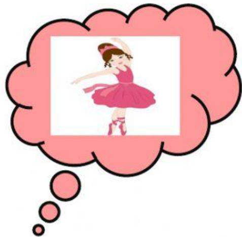
She is a dancer.