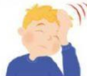
4 a headache