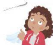
1 a cold