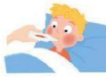
7 a temperature