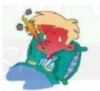
13 a fever