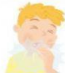
2 a cough