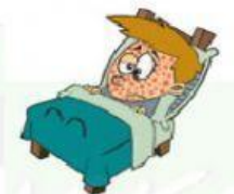
15 (the) measles