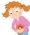
3 a stomach-ache