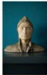
3 The bust