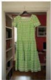
1 The dress

3 You are going to watch a video with three people talking about objects from their past. Before you watch, match these sentences (a–f) with the objects (1–3).