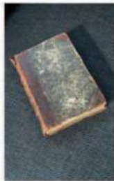
2 The book