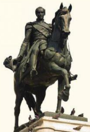
Bolívar led the fight for independence.

Simón Bolívar was born on July 24, 1783, in Caracas, Venezuela. He is known throughout Latin America as "The Liberator" because he led the fight for independence from Spain. His armies freed Venezuela, Bolivia, Colombia, Ecuador, and Peru. He is memorialized in many ways, but two countries celebrate his birthday every July 24 th —Venezuela and Ecuador. On that day, schools and most general businesses are closed, and there are military parades and government ceremonies. But the malls are open, and people usually use the holiday to go shopping.