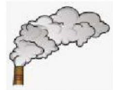
( smoke - fire )