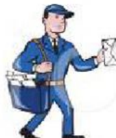
( engineer - mailman )