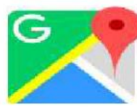
( drop rain - Google map )