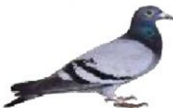
( pigeon - parrot )