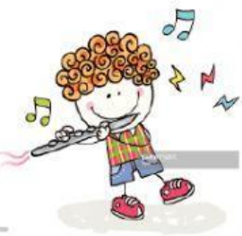
play the flute