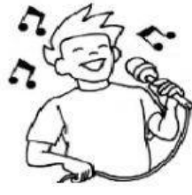
sing a song