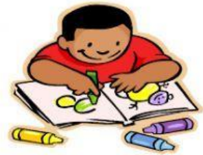
color the book