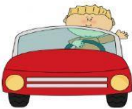
drive a car