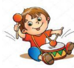
play the drums