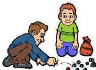
play with marbles