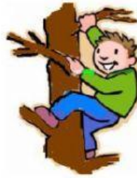
climb a tree