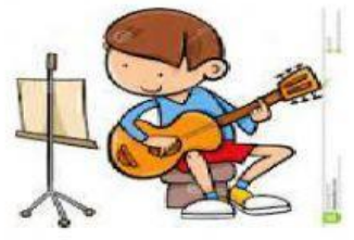
play the guitar