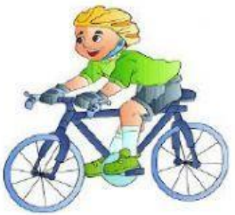
ride a bike