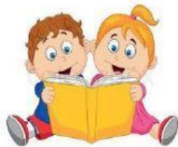
read a book