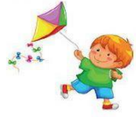
fly a kite