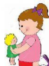
play with doll