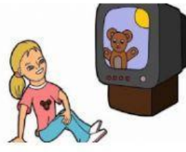
watch TV/watch cartoon