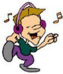
listen to music