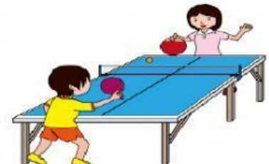
play table tennis