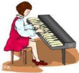
play the piano