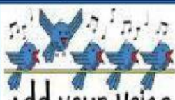
sing / with a high / voice

Fiona combs _____ eyebrows, but they aren't as _____ as Jon's and Lee's. Jon combs _____ eyebrows than Fiona and Lee combs _____ eyebrows of all.