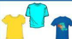
buy / large / T-shirt

Fiona smiles with _____ eyes, but they aren't as _____ as Jon's. Jon smiles with _____ than Fiona, Lee's eyes are _____ of all.