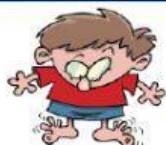
walk with / cold / feet

Fiona has got a _____ cat, but it isn't as _____ as Jon's and Lee's. Jon's cat is _____ than Fiona's. Lee's cat is _____ of all.