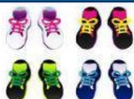
walk in / clean / shoes

Fiona sings with a _____ voice, but it isn't as _____ as Jon's and Lee's. Jon's voice is _____ than Fiona's and Lee's is _____ of all.