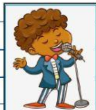
He is a singer