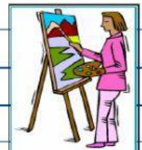
She is a painter