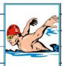
He is a swimmer

4. Select the correct form of the verbs according to the sentences.