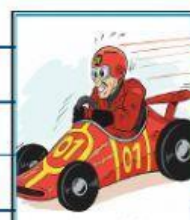
He is a driver