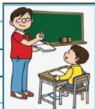
He is a teacher

3. What do they do? Complete the sentences according to the pictures.