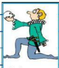
He is an actor