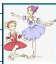
They are dancers