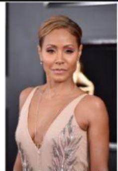
Jada Pinkett Smith

4. Who gave the "I Have A Dream" speech?