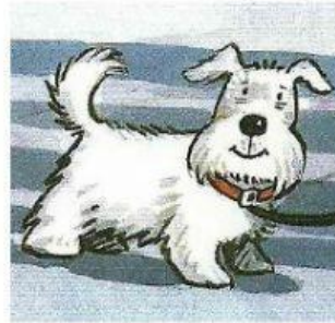
IT is a dog.