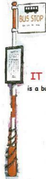
IT is a bus stop.