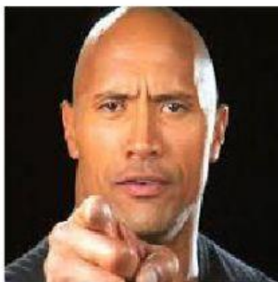
He ____ an actor