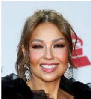
She ____ a singer