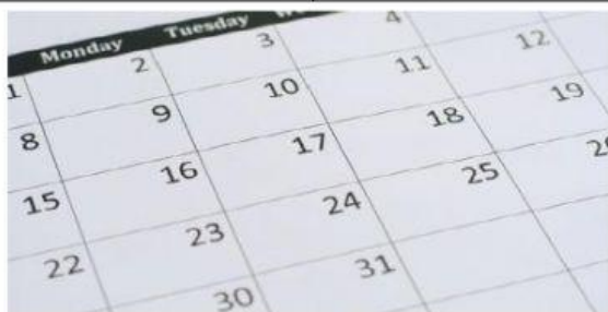
Yesterday ____ Monday