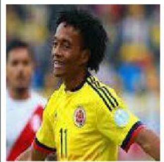
he ____ a footballer