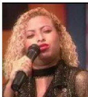
She ____ a singer