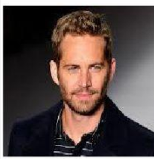
He ____ an actor