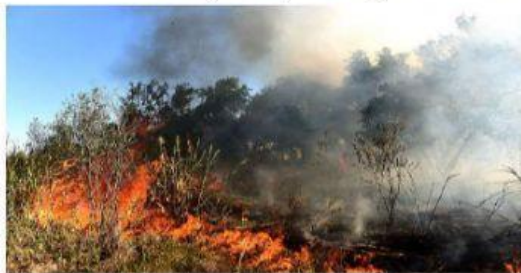
Fires burn in the Paraná Delta, Argentina.

Argentina's Paraná Delta is also on fire, threatening a vital ecosystem that is home to hundreds of species of plants and animals and helps regulate the climate. Like Brazil, these fires are mainly caused by farmers clearing the land for agriculture. However, the fires have been made worse by the strongest drought in 70 years and lack of rainfall. Fires are also now raging in Argentina's Córdoba province, threatening homes and forcing evacuations. These are also intentional fires, based on the economic interests of the agricultural and real estate sectors. Coupled with the droughts, they are causing irreversible destruction.