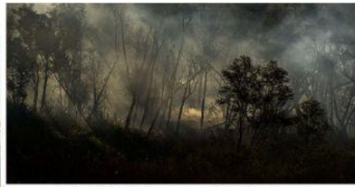
Fires burn in the Paraná Delta, Argentina.