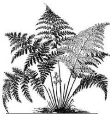
Fern plant in spring

Observe the following figures, and then answer the following questions