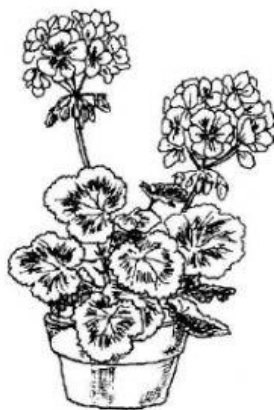
Geranium plant in spring