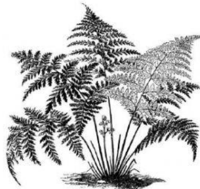
Fern plant in summer