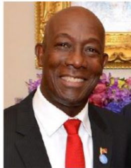
Dr. Keith Rowley