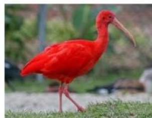
The Scarlet Ibis

3. Select the Coat of Arms of Trinidad and Tobago.