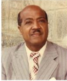
Sir Ellis Clarke