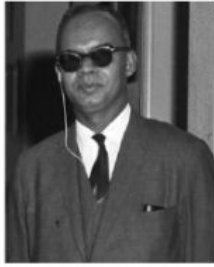
Dr. Eric Williams

4. Who was the first President of Trinidad and Tobago?