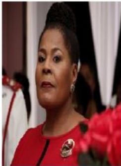
Her Excellency Paula-Mae Weekes

5. Who is the present Prime Minister of Trinidad and Tobago?