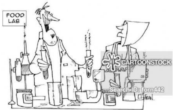
EUREKA...IT'S THE 'NATURAL' FLAVOUR WE'VE BEEN LOOKING FOR

Read the following cartoons and decide what statement describes better its message: