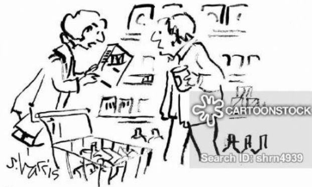
"SOME OF THE ADDITIVES CAUSE A NERVE DISORDER, BUT SOME OF THE OTHER ADDITIVES CURE IT."