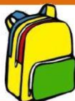
_____ school bag