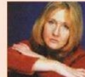
e JK Rowling