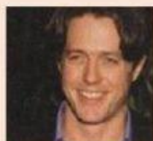
c Hugh Grant