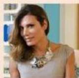
b Flor de la V