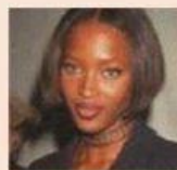
a Naomi Campbell