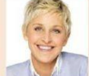
f Ellen Degeneers