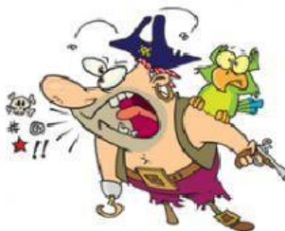
The pirate..... (shout)