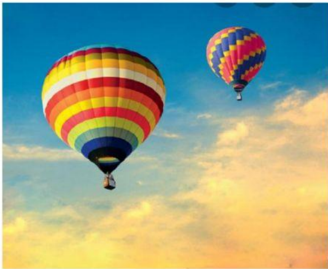
HOT AIR BALLOONS